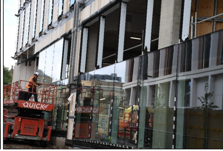
Adam Smith Business School façade system and glazing install continues to progress