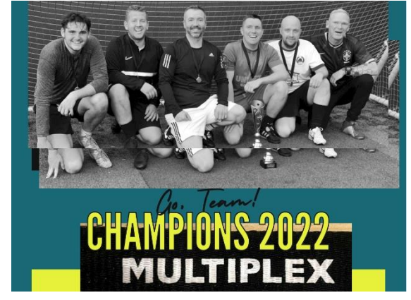
Congratulations to the winners and all those that took part, organised and supported