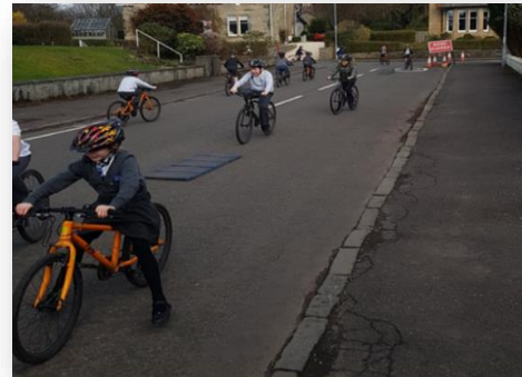
Image: A Bikeability Training Course in East Dunbartonshire

Four project themes are introduced , including a look at the impact these themes will have on East Dunbartonshire referring to case studies for each theme. The Project Themes are: