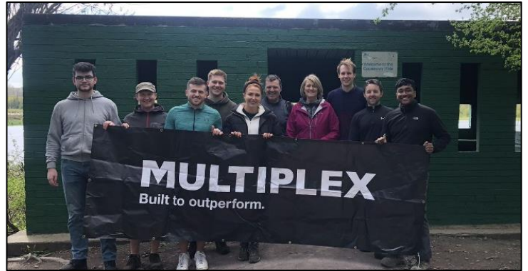
The Multiplex team supporting RSPB