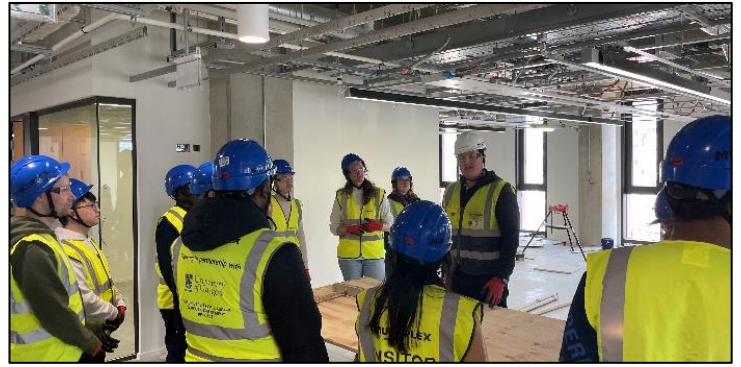
UofG Urbanism Society site visit