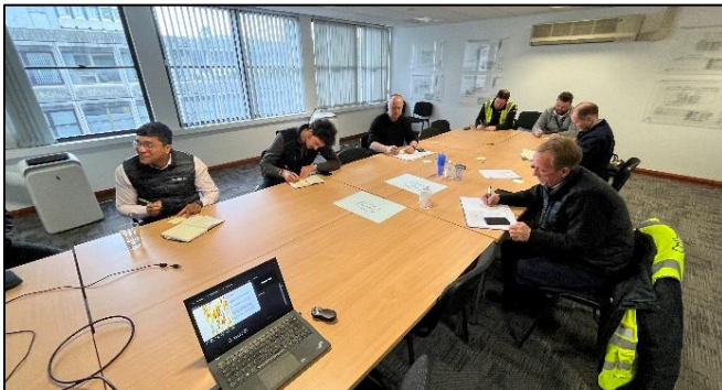
Supply Chain ESG Workshop