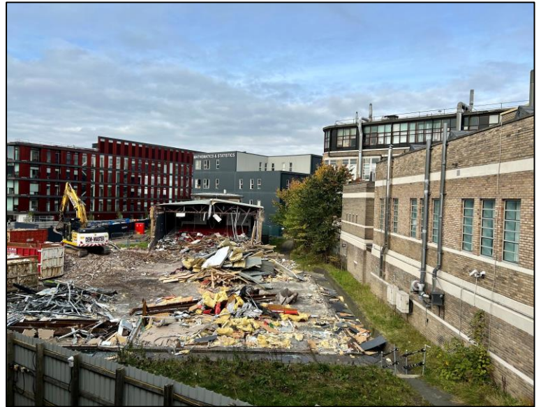
Demolition of the Western Infirmary Lecture Theatre (WILT)